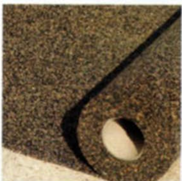
TEKNO 22 CR