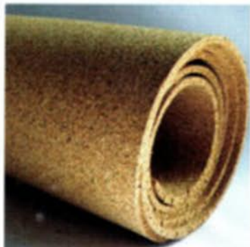
TEKNO 24 C